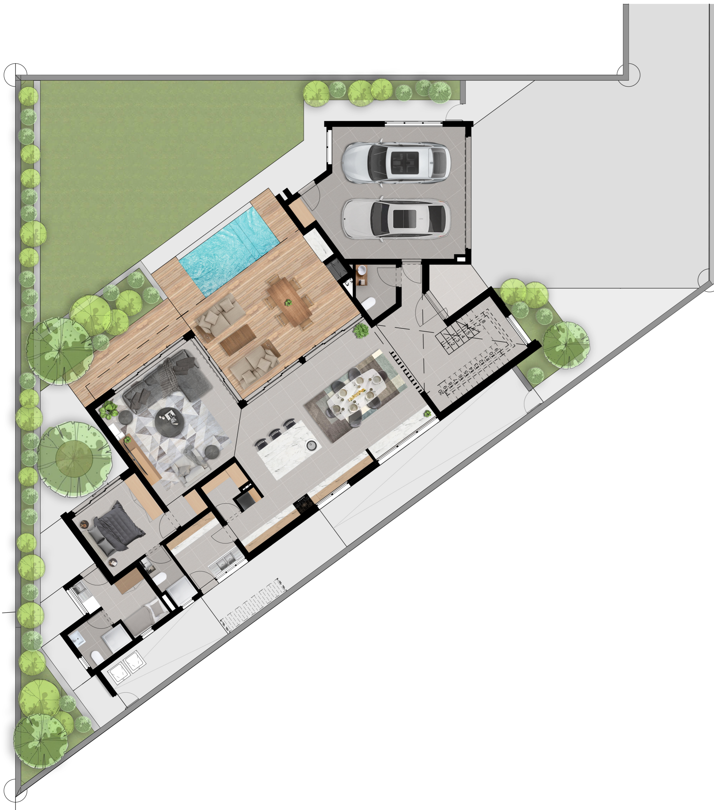
GROUND FLOOR Scale 1:100